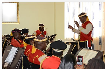
The Jamaica Military Band