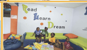
Official Project Launch