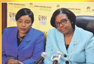
JIS Think Tank Session