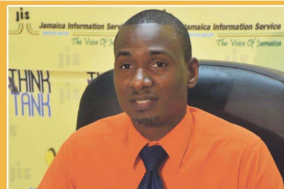
Microsoft Donation of Software